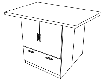
64"W x 60"D Work Area