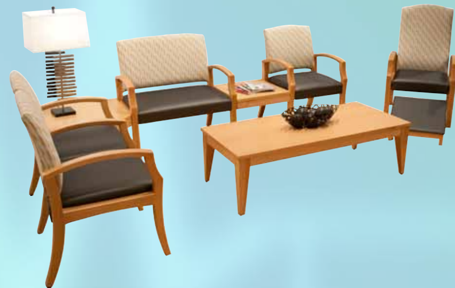
Unos Guest Seating

HPFI® offers a wide range of furniture solutions from the front lobby to the patient room and practically every room in between. HPFI has one of the broadest varieties of reception and waiting room furnishings in styles, finishes and upholsteries to meet the rigorous requirements of everyday use. Similarly, casegoods for offices, treatment and patient rooms are numerous. Choose from an abundant selection of tables, stacking and nesting chairs for dining areas, break rooms and training rooms. There's also a modular wall system as an alternative to costly millwork in treatment and patient rooms.