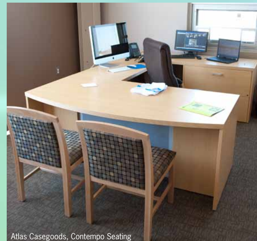
Atlas Casegoods, Contempo Seating