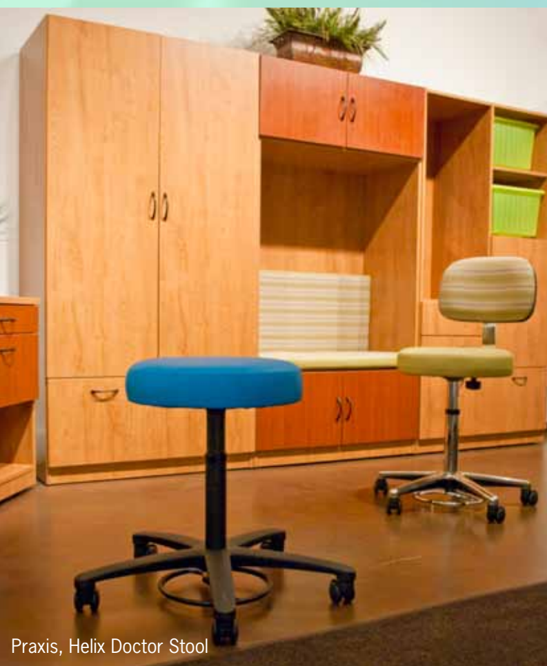
Praxis, Helix Doctor Stool

The HPFI Healthcare Collection is designed with you in mind.