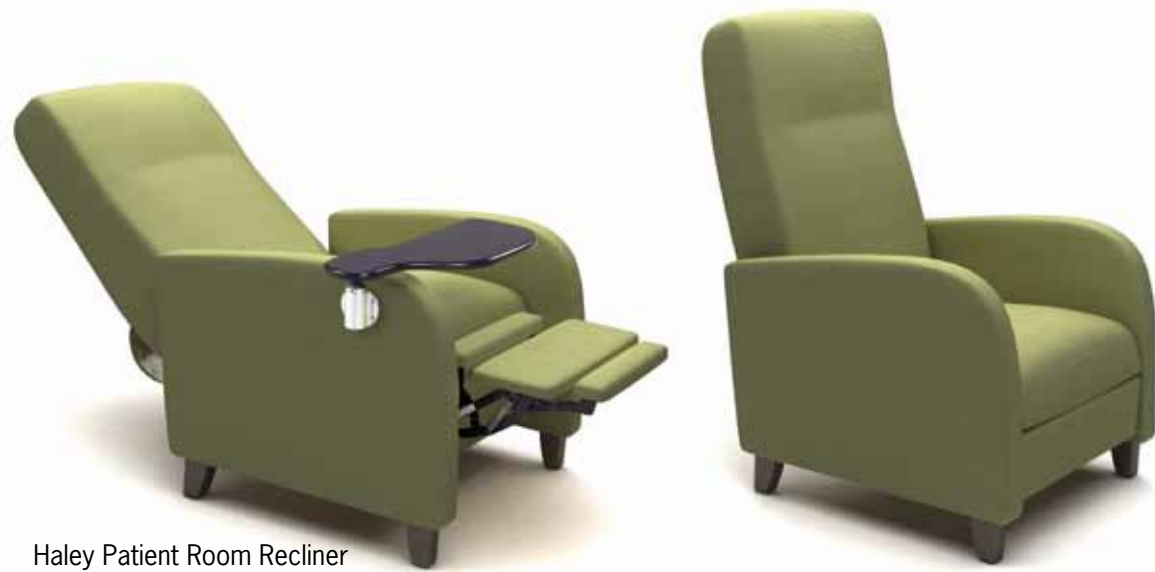
Haley Patient Room Recliner