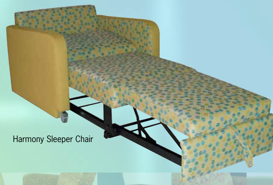
Harmony Sleeper Chair