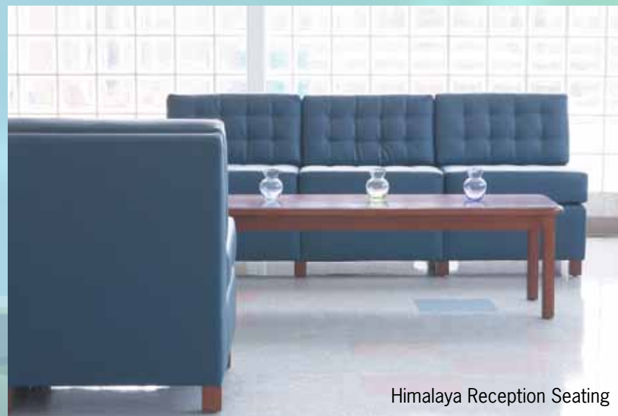
Himalaya Reception Seating