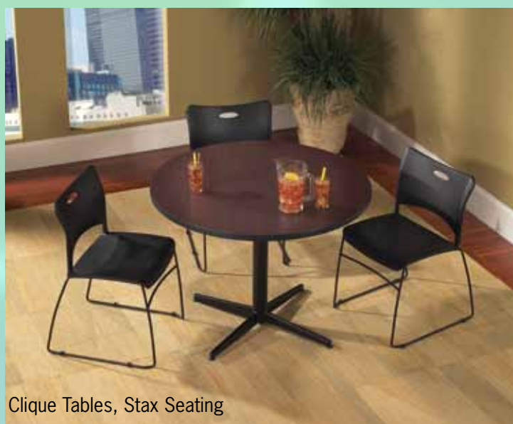
Cliques Tables, Stax Seating