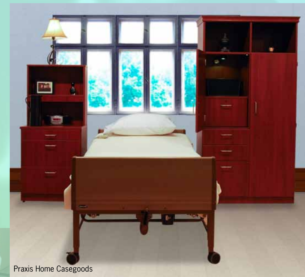
Praxis Home Casegoods