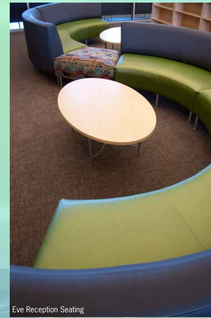
Eve Reception Seating