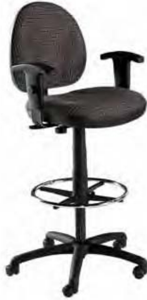
59050AT Extended-Height Task Armchair Replay WC790-006 Granite