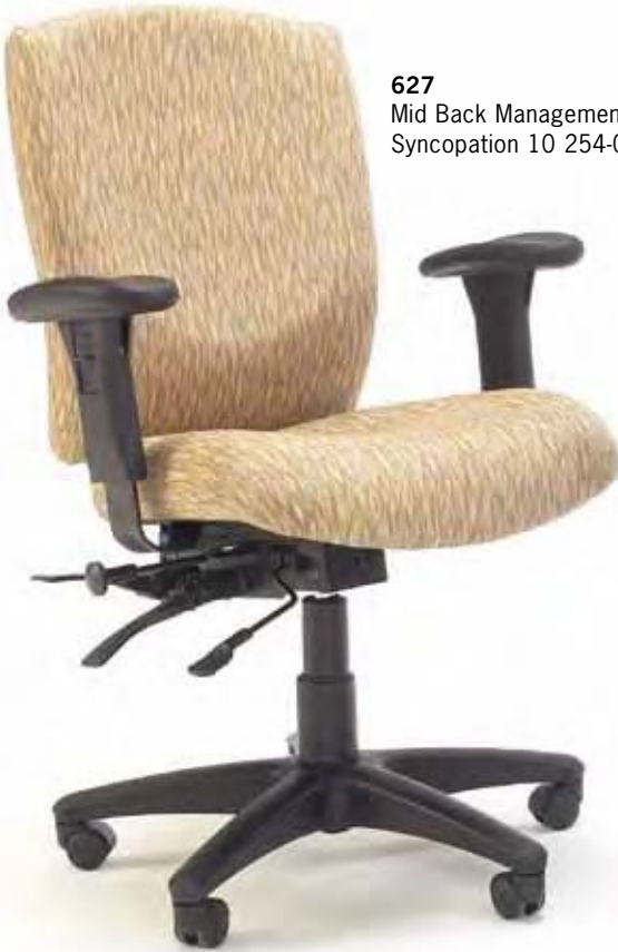
627 Mid Back Management Swivel Syncopation 10 254-007 Desert