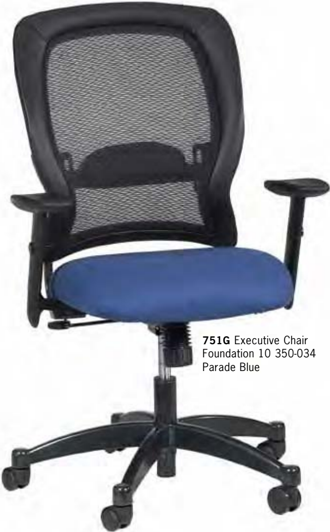
751G Executive Chair Foundation 10 350-034 Parade Blue