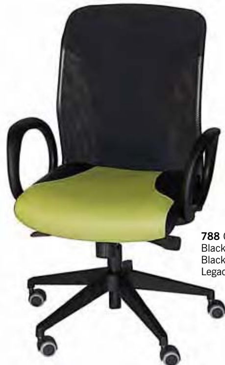
788 Conference Chair Black Base Black Back Legacy LY618 Pale Green Seat