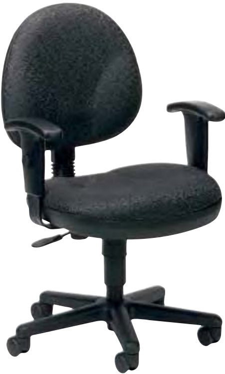
50050AT Task Chair Sketch 812 Carbon