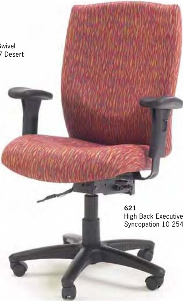
621 High Back Executive Swivel Syncopation 10 254-001 Chili