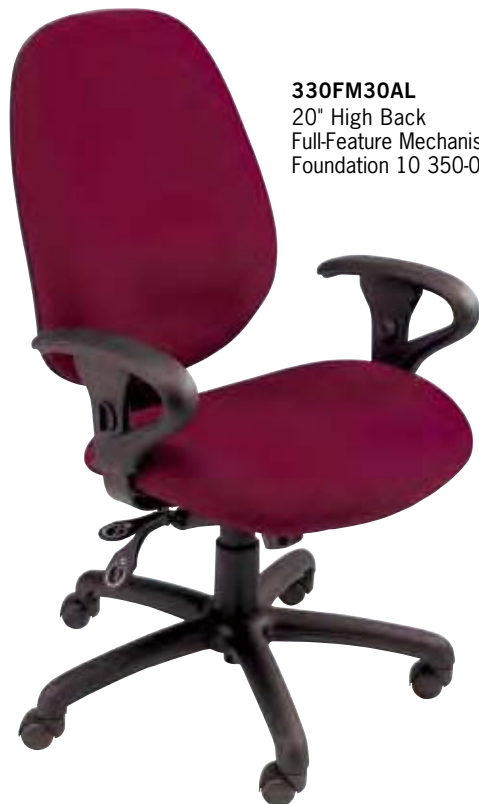
330FM30AL 20" High Back Full-Feature Mechanism Foundation 10 350-001 Wine