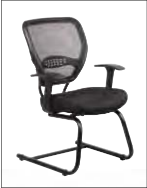
759 Guest Chair Breathable Fabric Seat