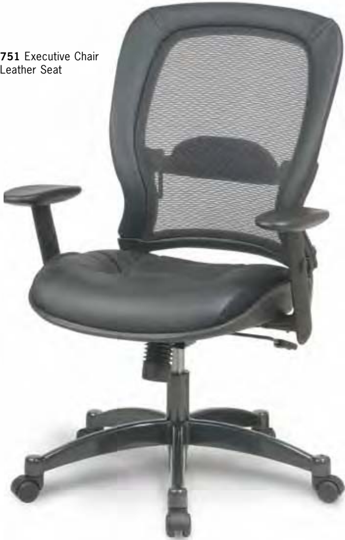
751 Executive Chair Leather Seat