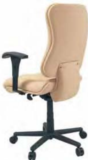
181 MAH Mahogany Jamestown 361 Oxblood