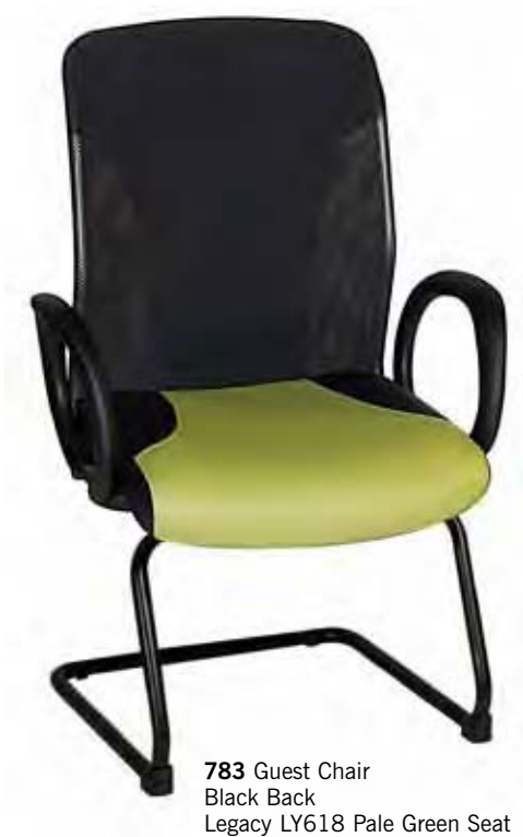
783 Guest Chair Black Back Legacy LY618 Pale Green Seat