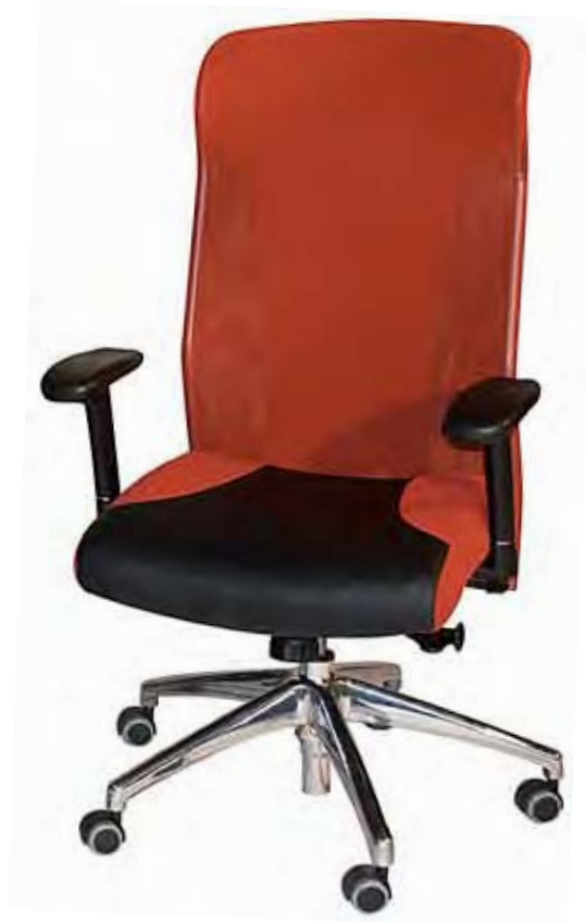
781CB Executive Chair Chrome Base Rouge Back Legacy LY625 Black Seat