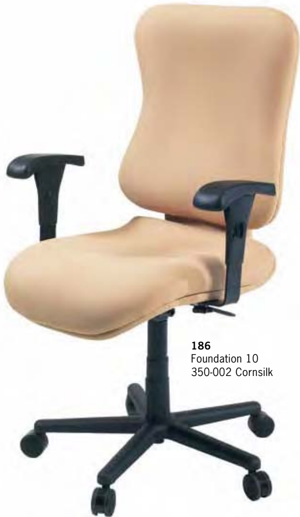
186 Foundation 10 350-002 Corsilk