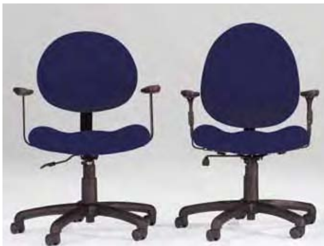
320BM30T Mid Back Task Cobblestone 670 Navy

Height and width-adjustable Loop Arms feature forward-slope and wide surface area for optimum comfort and support.